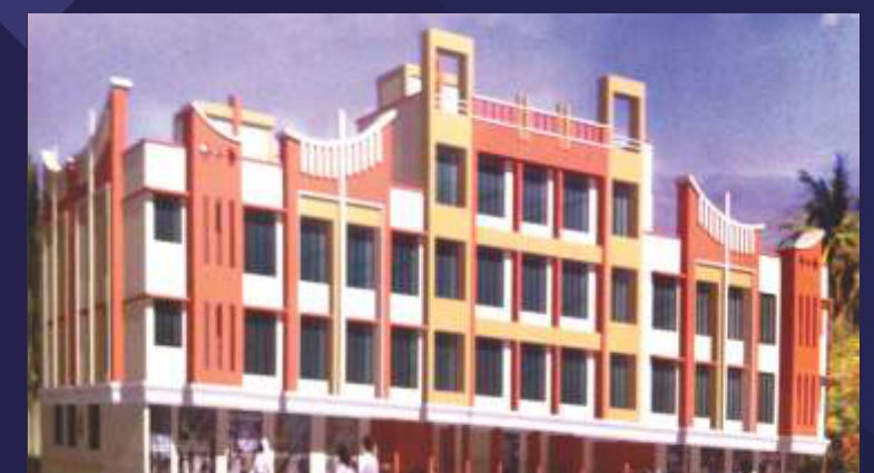
Ekveera Complex Wada