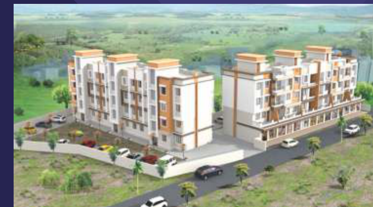
Raj Group Complex Kudus