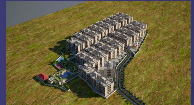
Gokuldhama Complex Padgha