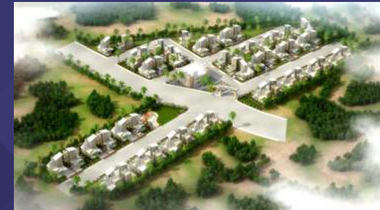
Ring Hills - Shahpur