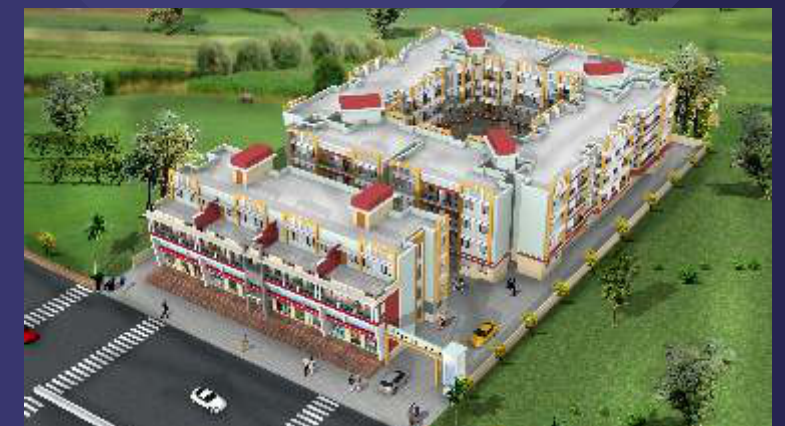
Chandra Bhaga Complex Kawad Bhiwandi