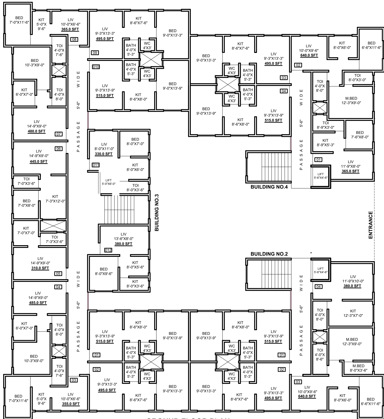
GROUND FLOOR PLAN BUILDING NO.2, 3 & 4