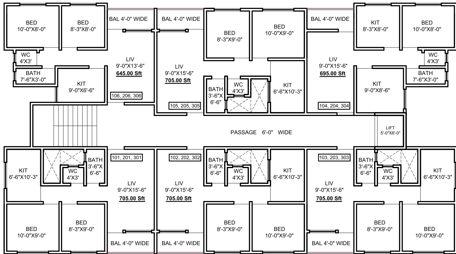
1ST TO 3RD FLOOR PLAN BUILDING NO.1