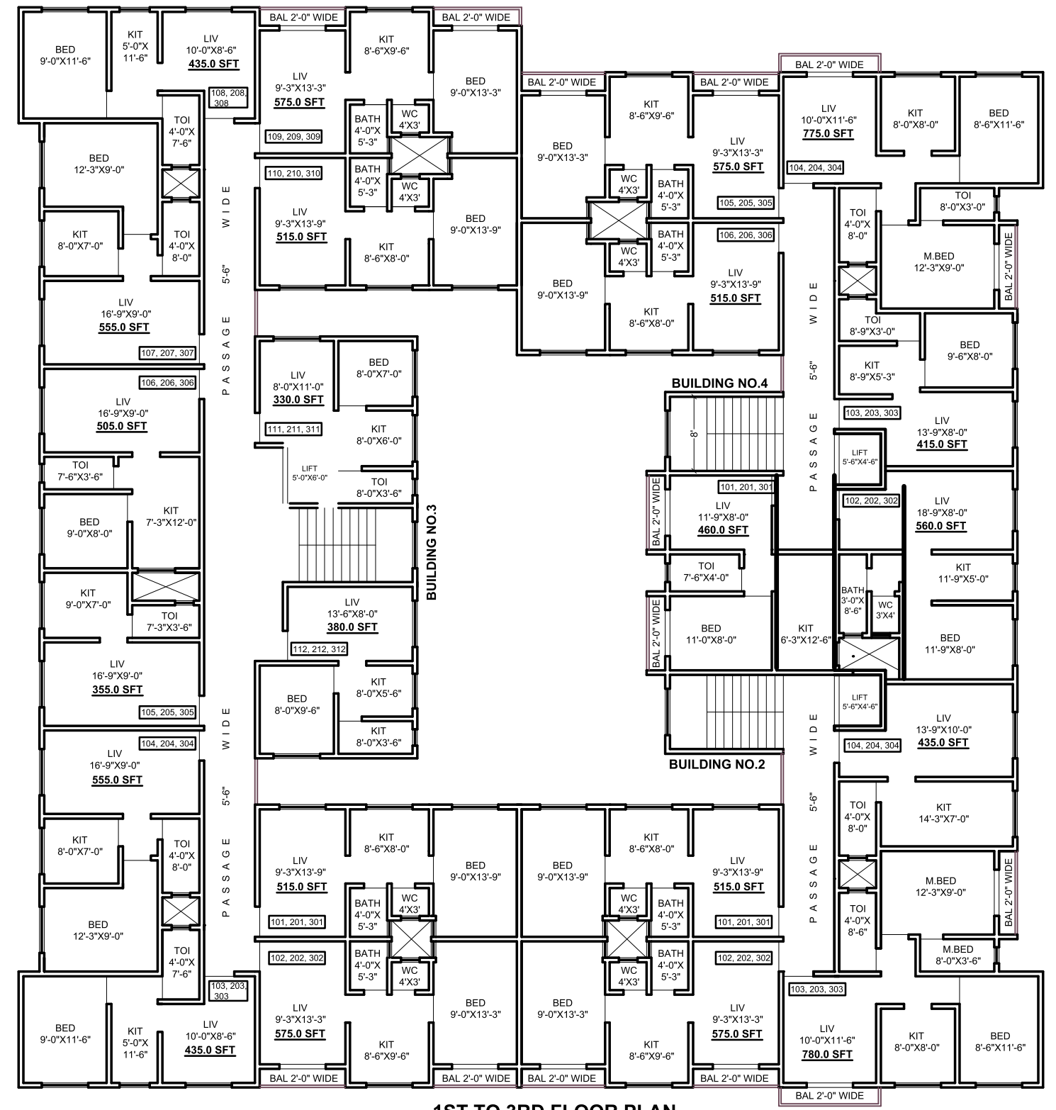
1ST TO 3RD FLOOR PLAN BUILDING NO.2, 3 & 4